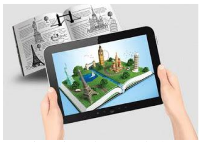
Figure 2 The example of Augmented Reality.

Based on object-tracking techniques, the augment system is divided into 3 types, namely positioning, marker, and markerless augmented reality services. The type of augmented reality positioning system is quite simple in its use. This system uses position as a marker, so it is usually combined with GPS on a smart phone. This type of augmented reality mark system uses techniques to detect markers that have been pre-programmed to be recognized. A marker is in the form of a square with a white background and with several black shades. These two colors are more often used because of the effect of light sensitivity on black and white so that it is easy to detect. This type of marker is commonly referred to as a static marker. But there are abstract forms. Marker types are often also categorized as markerless in the form of complex patterns consisting of writing, drawing, or color. This media enables the students to enrich their vocabularies, and also reading comprehension.